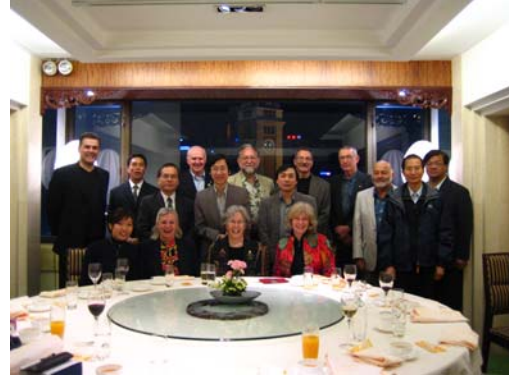
Group picture of ASCE Delegation and ASCE-HK Directors