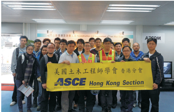
Participants at the project office of Tuen Mun Road Improvement Project on 17 March 2012