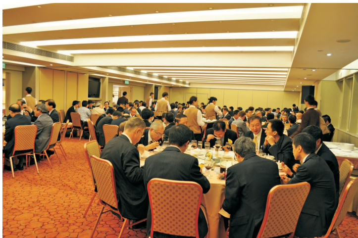
Honorable guests and fellow members enjoyed the annual dinner