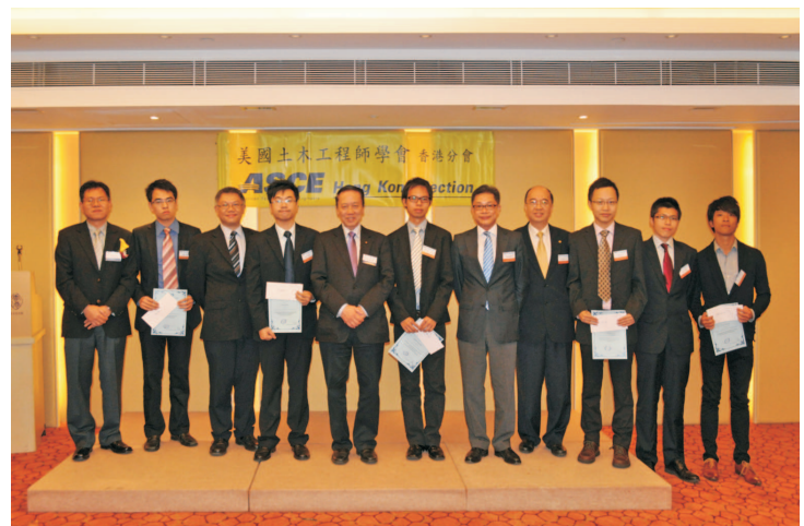
The honorable guest and the FYP winners and supervisors