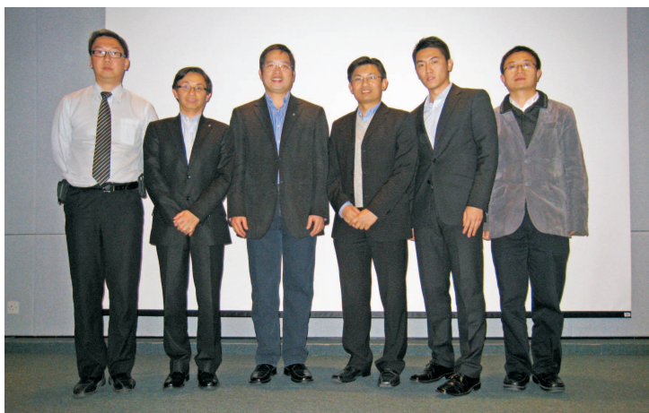
The speaker with Board Directors of ASCE (Hong Kong Section) and committee members of CIWEHK