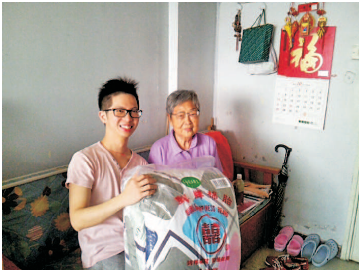
Social Service - Elderly Home Visit

Hong Kong Section took a leading role to invite Hong Kong Lutheran Social Service to participate in elderly home visits and bedquilt distributions on 27 October 2012 with more than 10 volunteers from Hong Kong Section Board Directors and Hong Kong Lutheran Social Service. During this three-hour visit, about 10 volunteers visited several households. With the volunteers' sincere care, the bedquilt and gift packs were distributed to the elderly who were happy and treasured the moments with our volunteers.