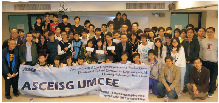
Participants and judges at the 5th Architectural Technique Contest on 25 March 2012