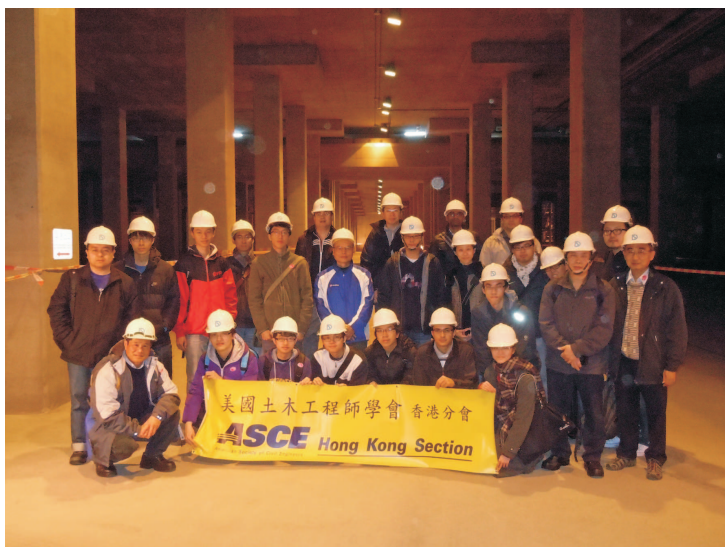
Visitors in the completed Tai Hang Tung underground flood storage tank