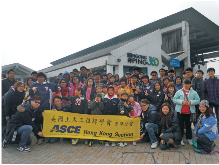
Board Directors and service participants at the Ngong Ping Village