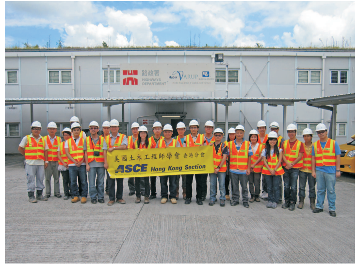
Participants at the project office of the Widening of Tolo/Fanling Highway project on 14 July 2012

features. We would like to express sincere gratitude to the staff from the project's contractor, HABVJV, for the informative site tour.