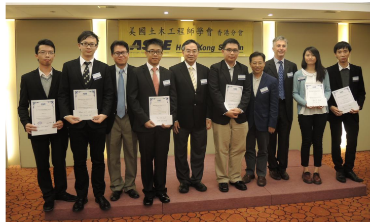
The awardees and their supervisor of the Best Final Year Project Award 2013