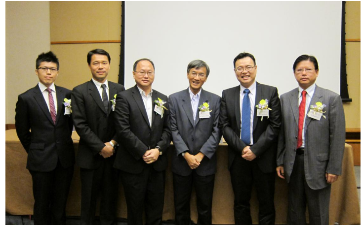
Group photo of the speakers in the Symposium on Green Materials

ASCE Hong Kong Section co-organized Symposium on Green Building Materials with, Nano and Advanced Materials Institute Limited, Hong Kong Trade Development Council and Construction Industry Council.