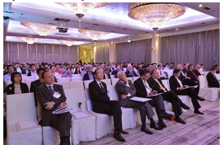
The audiences in the conference on Global Overview on Procurement Strategies: Striving Better Values

The conference was well attended by over 120 participants. It provided an excellent opportunity for academia and practicing engineers to share views and experience on the topic.