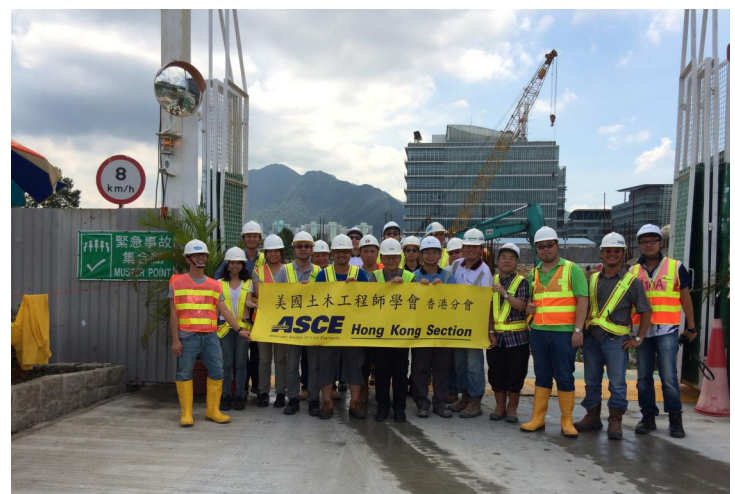
Group Photo at the construction site of Hong Kong Science Park Phase III

On 16 August 2014, about 20 participants attended a technical visit to Hong Kong Science Park Phase 3 Foundation Construction Site. As a green hub, Phase 3 will offer the 150 businesses located there one of the best R&D eco-systems in the region for developing and commercialising their products. The development is itself one of the largest showcases of sustainable construction practice in Hong Kong. The facilities at Phase 3 have been designed to be carbon neutral over its lifetime, using the key design principles of reduction, efficiency and generation. Bored Pile foundation design was adopted in this project and Bentonite is used to facilitate the drilling process in constructing the piles.