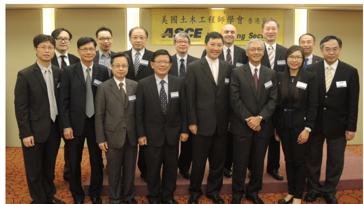
Other honorary guests and members of the Board of Directors