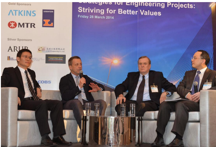
Panel discussion in the conference on Global Overview on Procurement Strategies: Striving Better Values