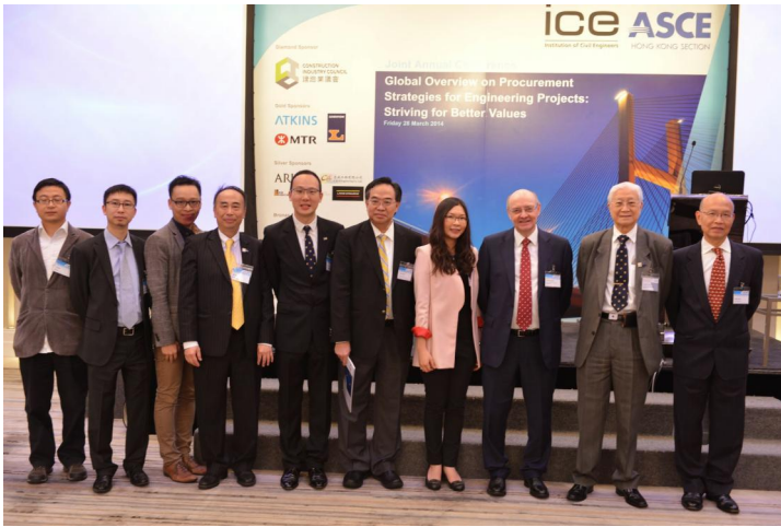
Organizing committee and the speakers in the conference on Global Overview on Procurement Strategies: Striving Better Values