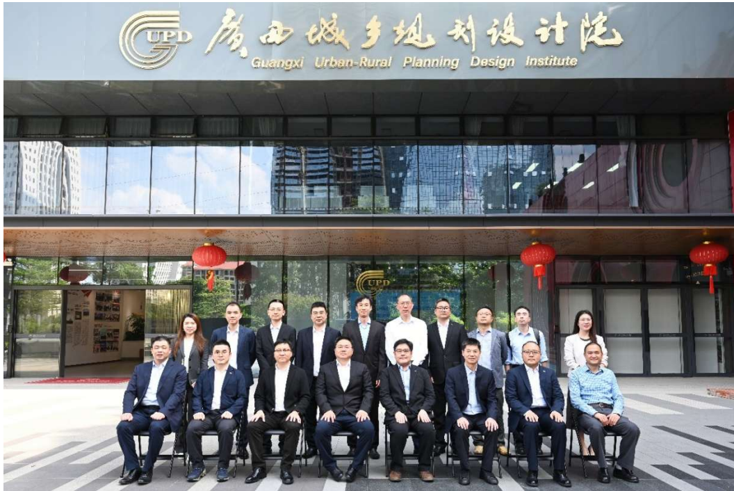
Group photo of the ASCE Greater China Section delegation, Region 10 representatives, alongside leaders and experts from the DHURD of the Autonomous Region, Guangxi Urban-Rural Planning and Design Institute, Guangxi Exploration and Design Association, and the Research Center