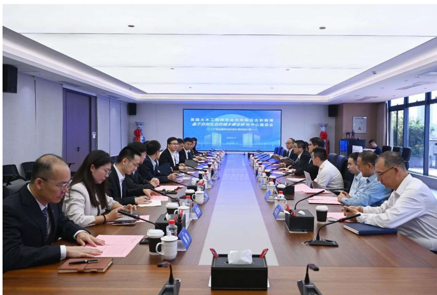
Exchange meeting with Guangxi Urban-Rural Planning and Design Institute