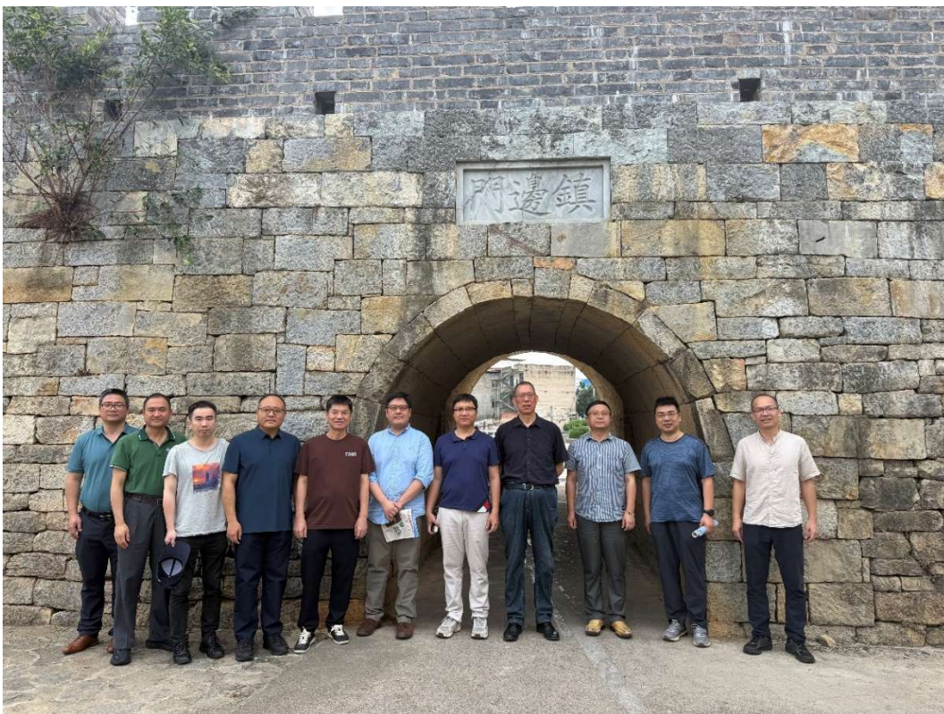
The ASCE Greater China Section delegation and Region 10 representatives inspecting the Taiping Ancient Town in Guangxi